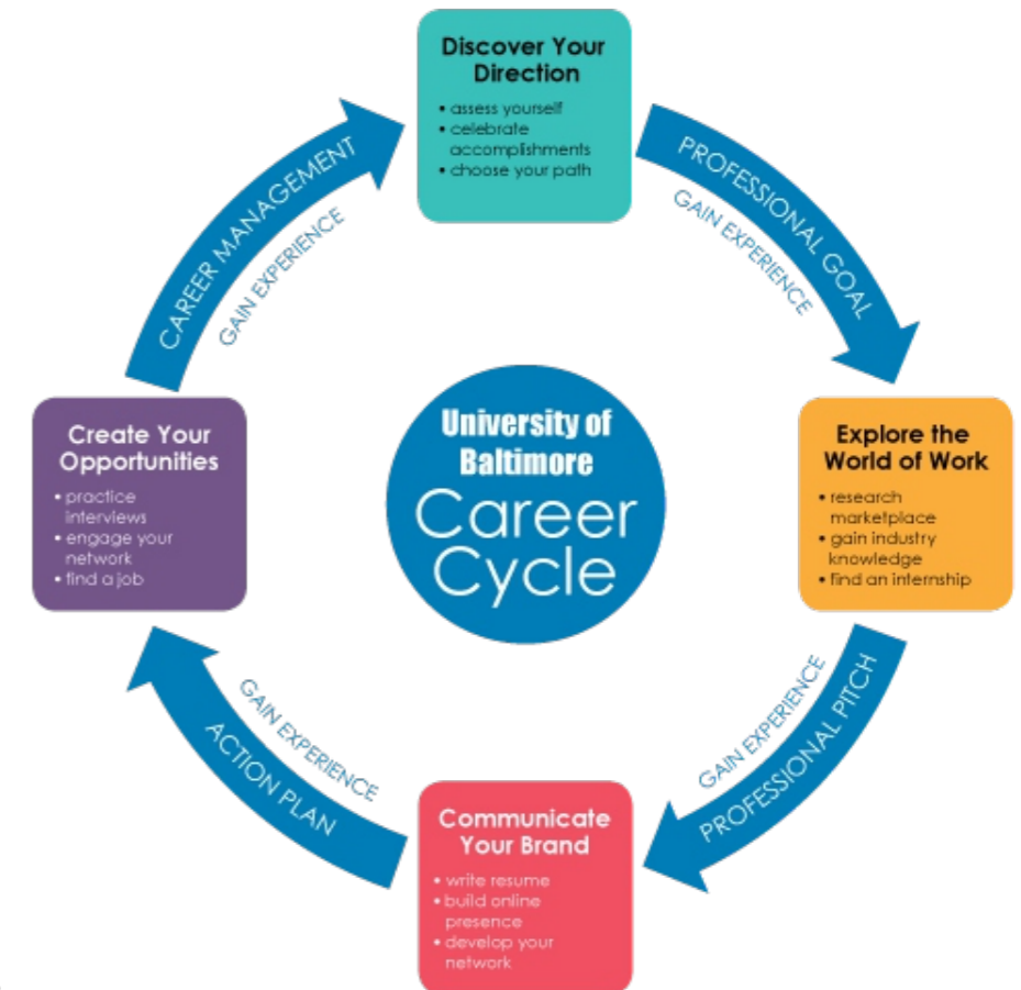
Figure 1 - Career Cycle

UBalt Learning Goals Met: Apply strategies that enhance professional and personal competence. Think critically and creatively to solve problems and adapt to new environments. Acquire knowledge about models of ethical behavior and understand its implications in the development of personal and professional relationships. Connect knowledge with choices and actions that engage others in diverse local and global communities.