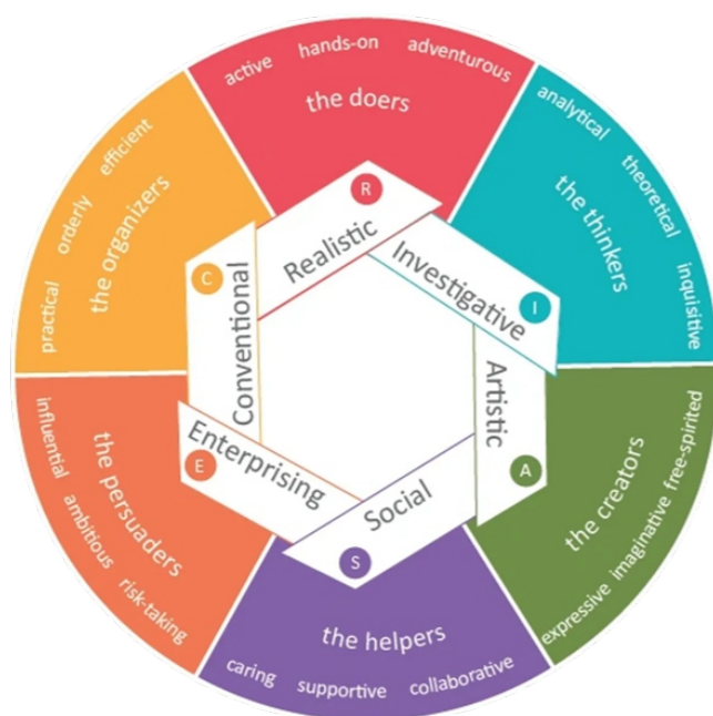
Figure 2 - iStartStrong Assessment

UBalt Learning Goals Met: Apply strategies that enhance professional and personal competence. Develop an integrated and specialized knowledge and skills base. Think critically and creatively to solve problems and adapt to new environments. Connect knowledge with choices and actions that engage others in diverse local and global communities.