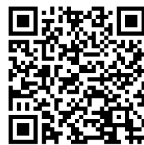
Princeton Review (GRE)